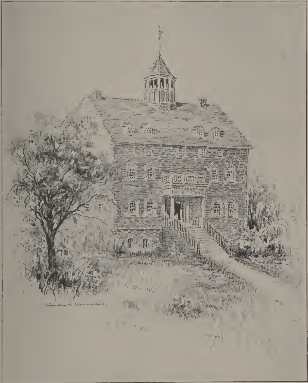
THE PROVINCE HOUSE